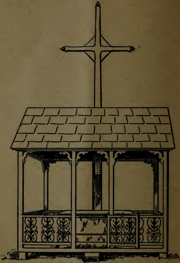
KATERI TEKAKWITHA'S SHRINE AT THE FOOT OF THE LACHINE RAPIDS NEAR MONTREAL