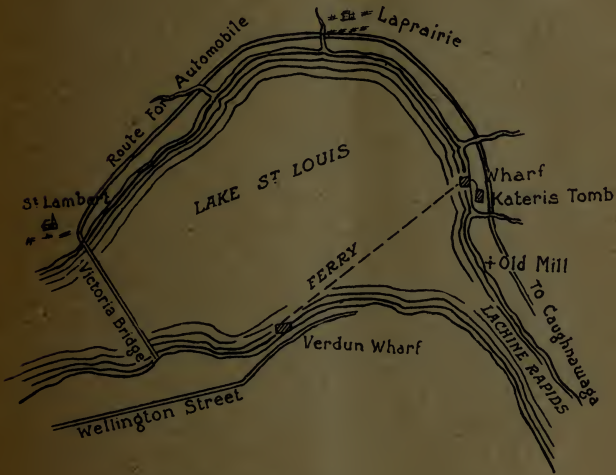
PILGRIM ROUTES FROM MONTREAL TO KATERI'S SHRINE

asserted that he was kept busy attending to the French population who continued to flock to her tomb to fulfil vows made in time of sickness. In 1755, when the Indian mission of St. Francis Regis