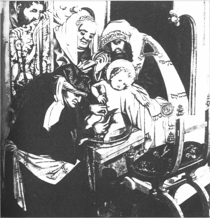
Fig. 19. Circumcision of Christ , altar piece, circa 1450, Nuremberg, Liebfrauenkirche.