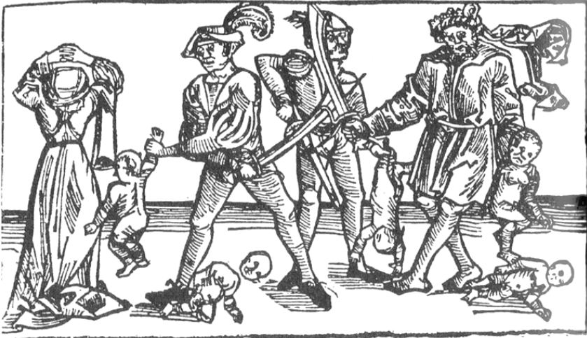
Fig. 3. The Massacre of the Innocents , woodcut from the Ultraquist Passional , Prague, Jan Camp, 1495.