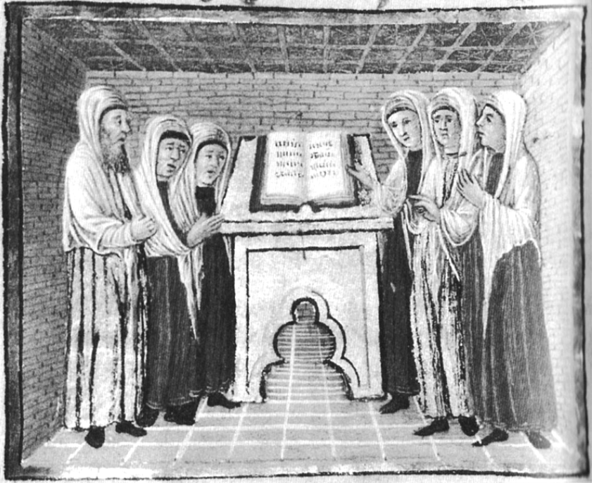
Fig. 22. Oratory of German Jews with the “almemor”, miniature from the Rothschild Miscellany , Venice (?), 1475, Jerusalem, Bezalel Museum.