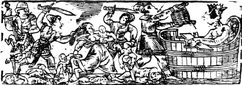
Fig. 2. The Pharaoh's Bath of Blood , woodcut from the Passover Haggadah, without publisher, circa 1580.

פרעם אין יידן קינדער בלוט ער טאט ציארן : גאט און סולניג בלוט ניט און גראסן וול לאן