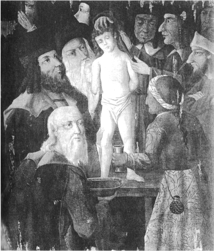
Fig. 21. Alto Adige School, Martyrdom of Simonino , first half of