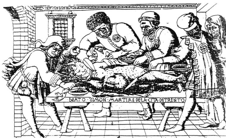
Fig. 16. Martyrdom of Simonino and Jews with Eyeglasses , woodcut, Northern Italy 1475-85 (from A.M. Hind, Early