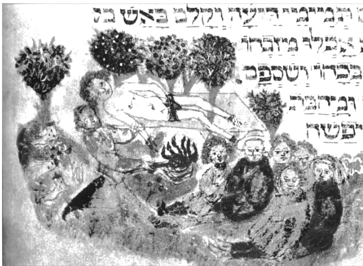
Fig. 14. German Jew Tortured with Fire , miniature from Jewish Code 37 from the Hamburg State and University Library (c. 79r).