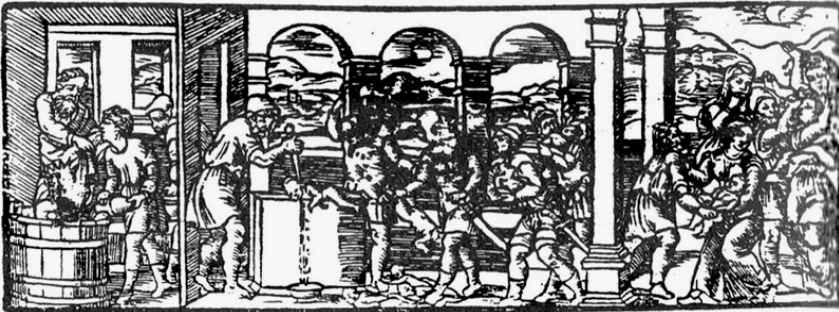
Fig. 4. The Pharaoh's Bath of Blood , woodcut from the Passover Haggadah , Mantua, Giacomo Rufinelli, 1560.