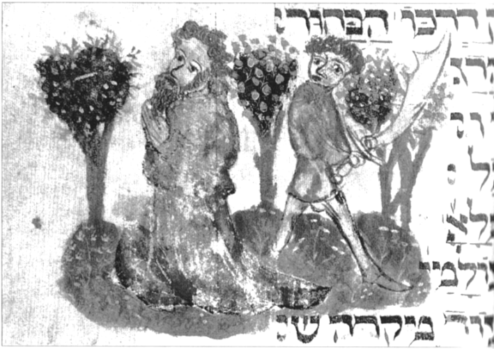
Fig. 13. German Jew Being Executed with a Sword , miniature from Jewish Code 37 from the Hamburg State and University Library (c. 79r).