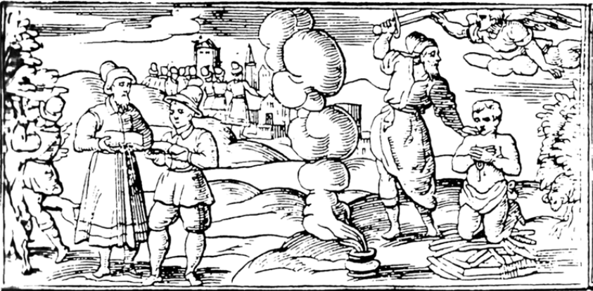
Fig. 12. Sacrifice of Isaac , woodcut from the Passover Haggadah, Venice, Giovanni De Gara, 1609.