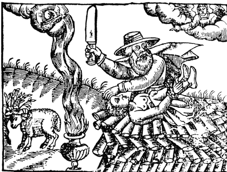
Fig. 15. Sacrifice of Isaac , woodcut from the Ritual Responsals (Sheelot w-teshuvot) of Asher b. Yechiel, Constantinople, without publisher, 1517.