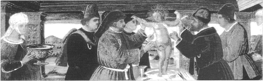
Fig. 20. Gandolfino da Roreto d' Asti, Martyrdom of Simonino , tempera on wood, end of 15th century, Jerusalem, Israel Museum.