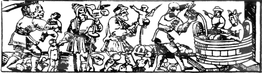
Fig. 1. The Pharaoh's Bath of Blood , woodcut from the Passover Haggadah, Prague, Gershom Cohen, 1526.

פרעם אין יידן קינדער בלוט ער טאט ציארן : גאט און סולניג בלוט ניט און גראסן וול לאן