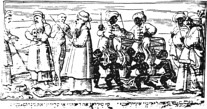
Fig. 7. Enchanters and Necromancers , woodcut from the Passover Haggadah, Venice, Giovanni De Gara, 1609.