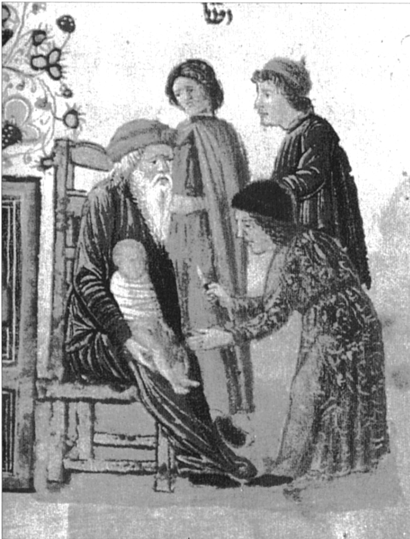
Fig. 17. Circumcision , miniature from the Rothschild Miscellany , Venice (?), 1475, Jerusalem, Bazelel Museum.