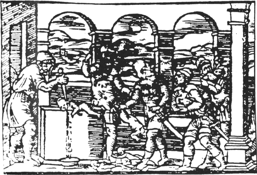
Fig. 5. The Pharaoh's Bath of Blood , woodcut from the Passover Haggadah, Mantua, Giacomo Rufinelli, 1560 (detail).