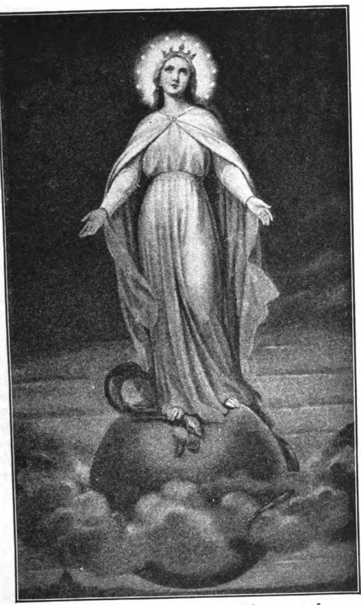
O Mary, conceived without sin, pray for us who have recourse to thee.—100 days' indulzence, once a day. Leo XIII.