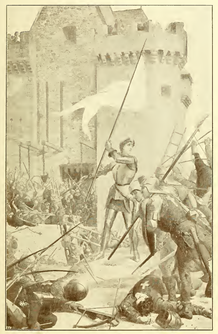
THE TAKING OF ORLEANS BY JOAN OF ARC