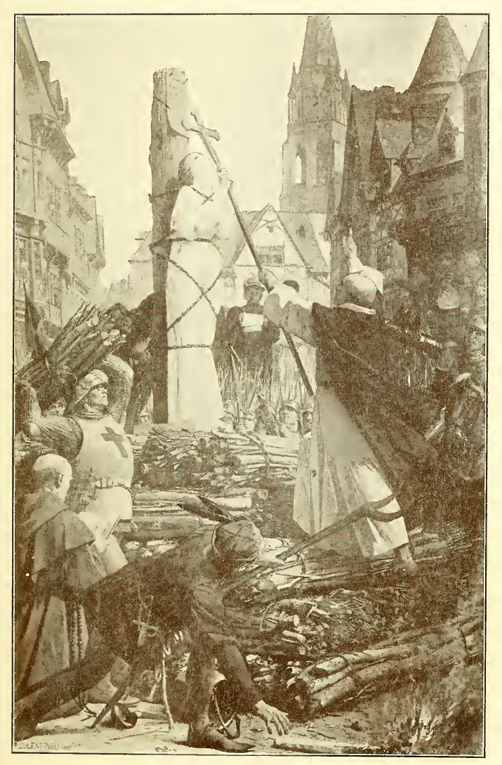
THE DEATH OF JOAN OF ARC