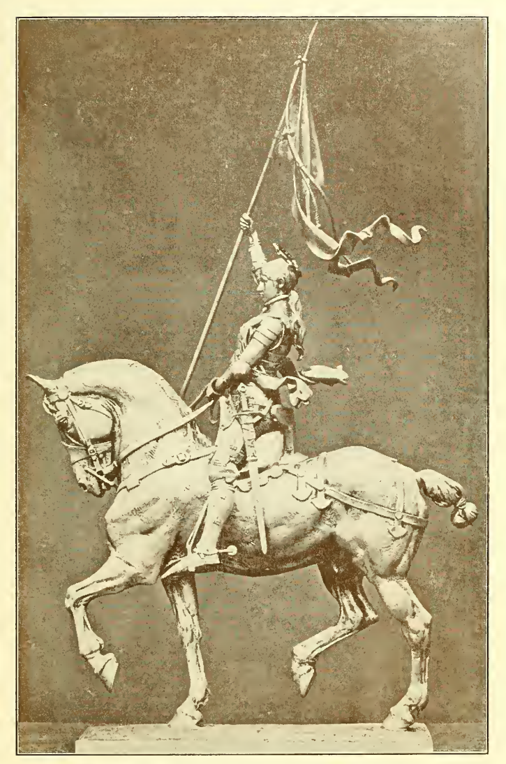
EQUESTRIENNE STATUE OF JOAN OF ARC