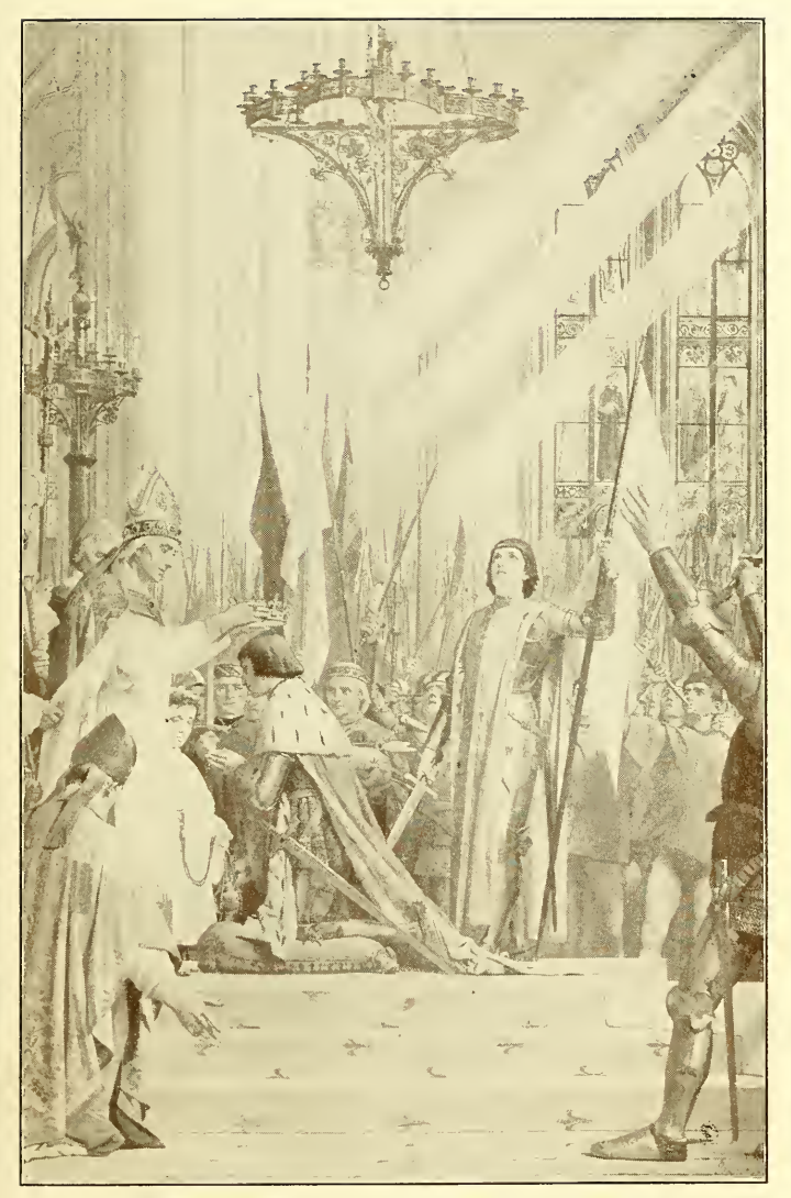
THE CORONATION OF CHARLES VII AT RHEIMS