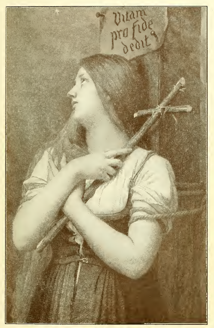
JOAN THE MARTYR