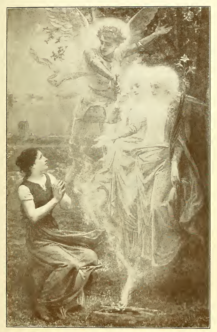
JOAN SEES A VISION