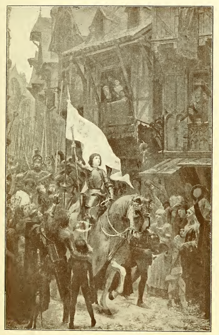
JOAN OF ARC'S TRIUMPHANT ENTRY INTO ORLEANS