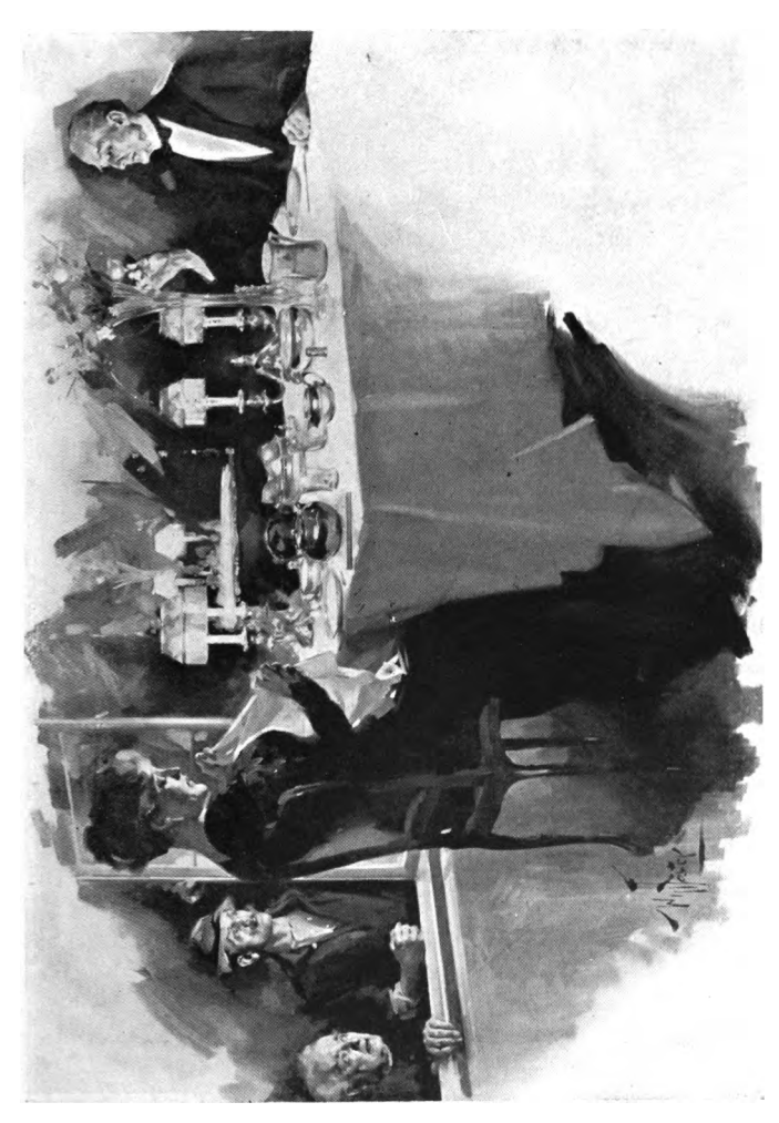
" PAUL, PRINCE SARADINE, à vos ordre:"