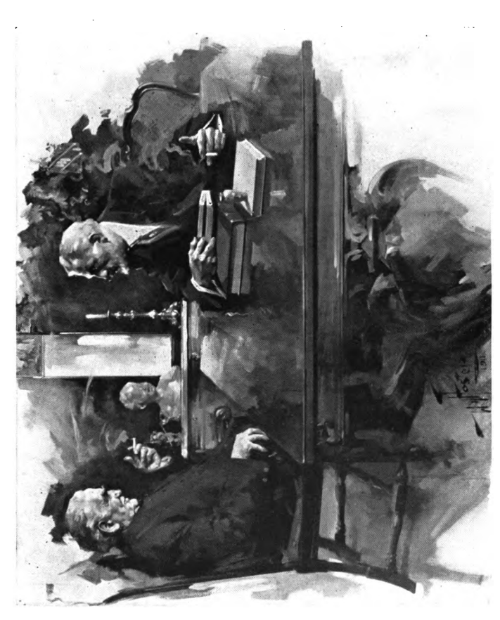
HE HAD LITTLE NERVOUS TRICKS, LIKE A MAN SHAKEN BY DRINK OR DRUGS