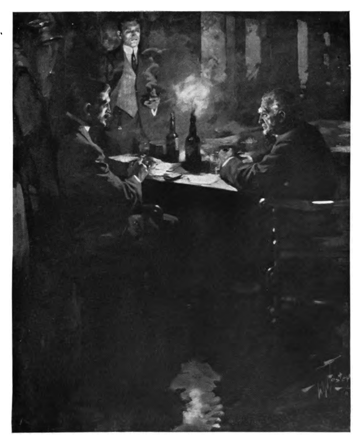
"THERE IS BLACK MAGIC SOMEWHERE AT THE BOTTOM OF THIS"