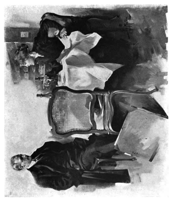
"MY FATHER OWNED THE INN CALLED THE 'RED FISH,' AND I USED TO SERVE PEOPLE IN THE BAR"