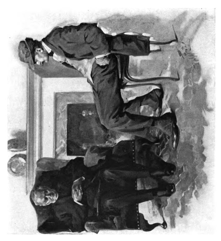
"YOU MUST HAVE FOLLOWED EVERYTHING DEVILISH CLOSE TO HAVE TRACED THE CRIME"