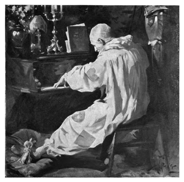
THE CLOWN AT THE PIANO PLAYED THE CONSTABULARY CHORUS FROM "THE PIRATES OF PENZANCE"